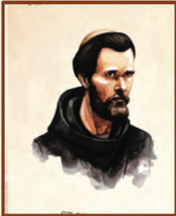
Saint Augustine The Teacher