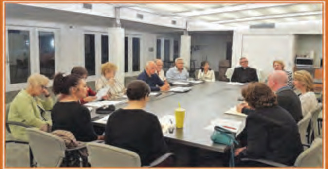
The Parish Anniversary Committee met on Wednesday October 4 th to finalize some of the Activities for the Fiftieth Anniversary Celebration.

St. Thomas More Parish celebrates its 50th Anniversary in 2018! We are kicking off this year-long celebration with the Novena of St. Thomas More beginning November 8, 2017. More details will be available as the date draws nearer. We invite and encourage all to take part in the activities in this Anniversary Year!