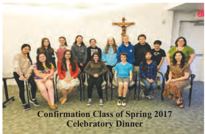
Confirmation Class of Spring 2017 Celebratory Dinner

Children’s Home Clothing Drive May 13/14th. An extra incentive to Spring Clean your closets! Accepting: clothes & shoes, books, toys, working electronics and housewares, small furniture, jewelry and seasonal/holiday items.