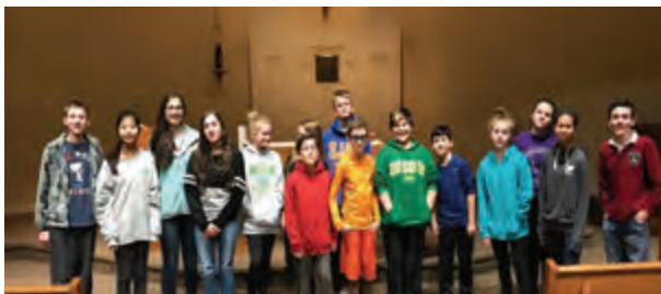
After Stations of the Cross and Reflection, our Altar Servers share what being an Altar Server means to them.

Papal Intentions for the Month of April: That young people may respond generously to their vocations and seriously consider offering themselves to the priesthood or the consecrated life.