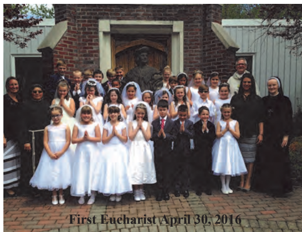
First Eucharist April 30, 2016

Prayer Shawl Ministry meets Thursday, May 12 at 9:30 am in the Parish Hall.