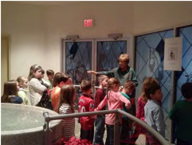
Religious Education students preparing for First Reconciliation.