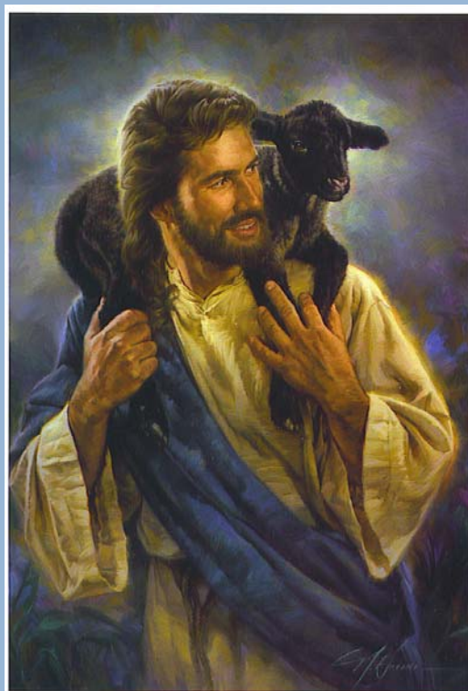
Parable of the Lost Sheep

Some of the most memorable teachings of Jesus were delivered as parables and are found in the Gospels of Matthew, Mark, and Luke. This study explores these parables and their meaning for us today.